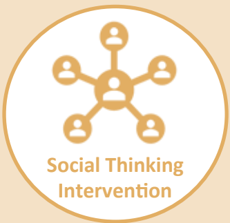
Social Thinking Intervention