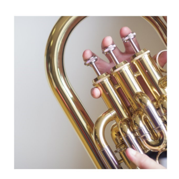
Welcome to Nailsea School Induction Booklet 2025