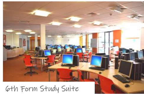
6th Form Study Suite