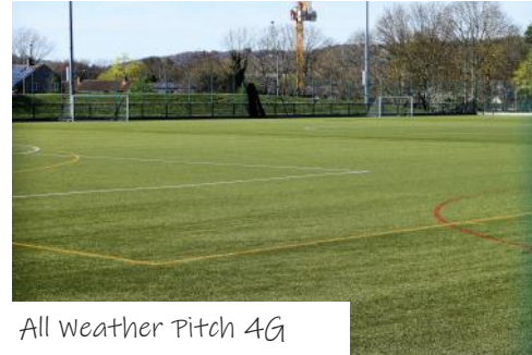
All Weather Pitch 4G