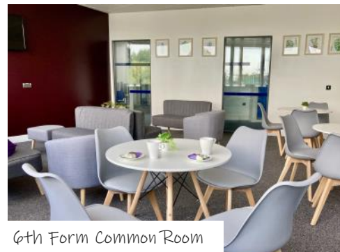
6th Form Common Room