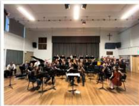
Kings of Wessex & Nailsea rehearse together