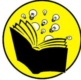
assessment objective 1

Develop ideas through investigations, demonstrating critical understanding of sources.