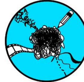
assessment objective 3

Record ideas, observations and insights relevant to intentions as work progresses.