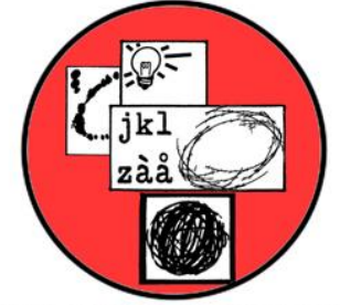
assessment objective 4

Present a personal and meaningful response that realises intentions and demonstrates understanding of visual language.