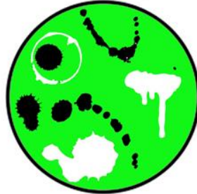
assessment objective 2

Refine work by exploring ideas, selecting and experimenting with appropriate media, materials, techniques and processes.